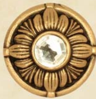
Montrose Knob Crystal, Bronze 717MKC-B