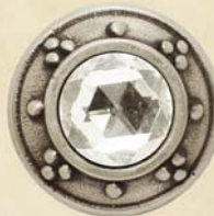
Carmel Knob Crystal, Silvertone 311CKC-S