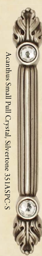
Acanthus Small Pull Crystal, Silvertone 351ASPC-S