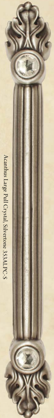
Acanthus Large Pull Crystal, Silvertone 353ALPC-S