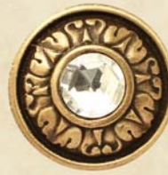
Acanthus Round Knob Crystal, Bronze 315ARKC-B