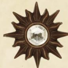
Bronze Sun Accent Crystal, Oil Rubbed B506C-OR