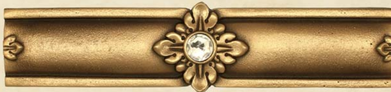
Acanthus Liner Crystal, Bronze 218ALC-B