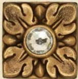
Acanthus Small Crystal, Bronze 113ASC-B