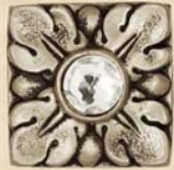
Acanthus Small Crystal, Silvertone 113ASC-S