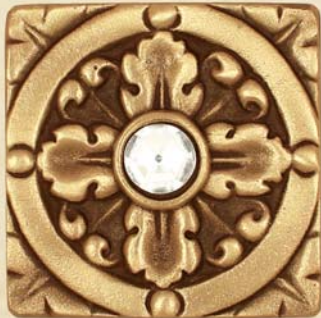
Acanthus Medium Crystal, Bronze 108AMC-B