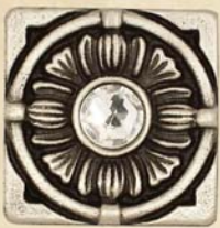
Montrose Small Crystal, Silvertone 714MSC-S