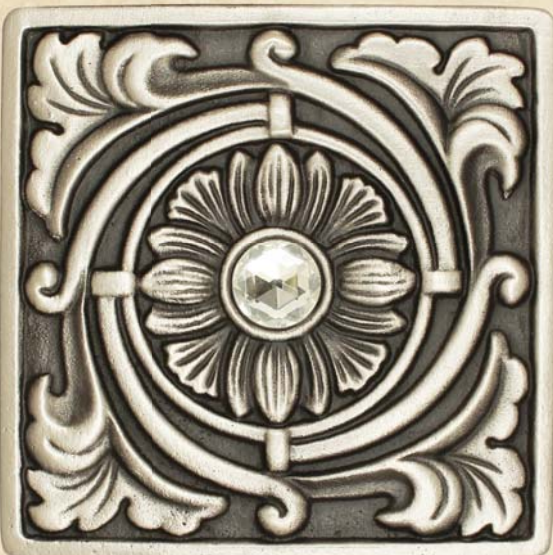
Montrose Large Crystal, Silvertone 711MLC-S