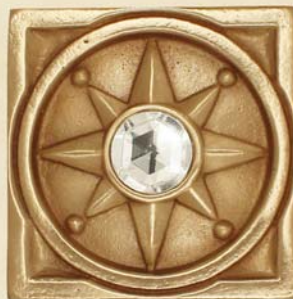
Compass Rose Crystal, Bronze Bright 124CRC-BB