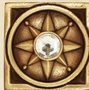
Compass Rose Crystal, Bronze 124CRC-B