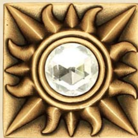
Sahara Crystal, Bronze 721SC-B