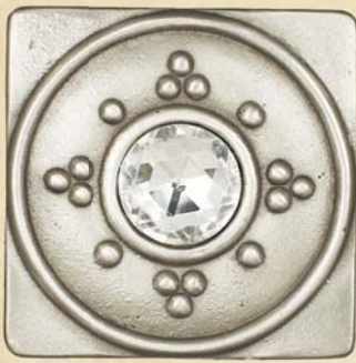
Carmel Crystal, Silver Bright 140CC-SB