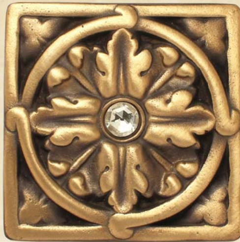
Acanthus Large Crystal, Bronze 109ALC-B