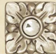
Acanthus Small Knob Crystal, Silver Bright 313ASKC-SB

In the product codes the "C" that precedes the finish code designates the Crystal selection for these pieces (for example: Acanthus Liner Crystal in Bronze is 218 ALC-B)